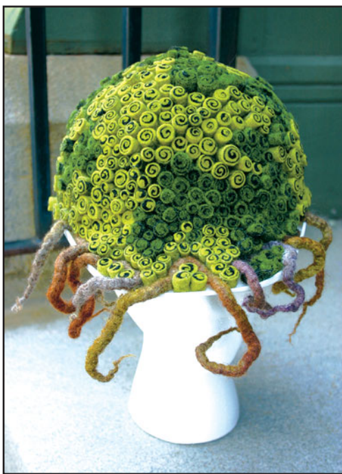
"Felt Landscape" by Fafnir Adamites of Turners Falls