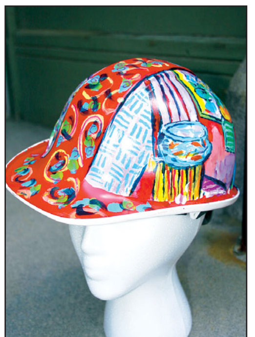
"Matisse Fantasy" by GCC Art Department Alumni