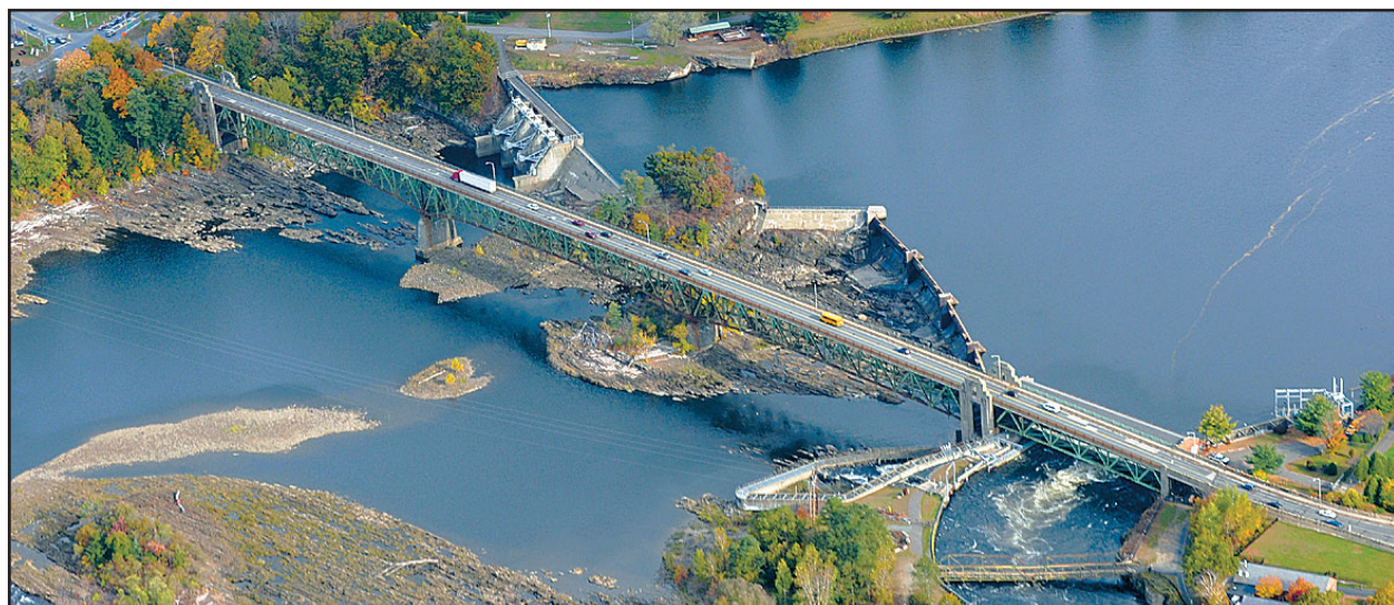
Bird's Eye Views photo

"I really enjoy the challenge of how to put things together. That's what keeps me interested in sculp-